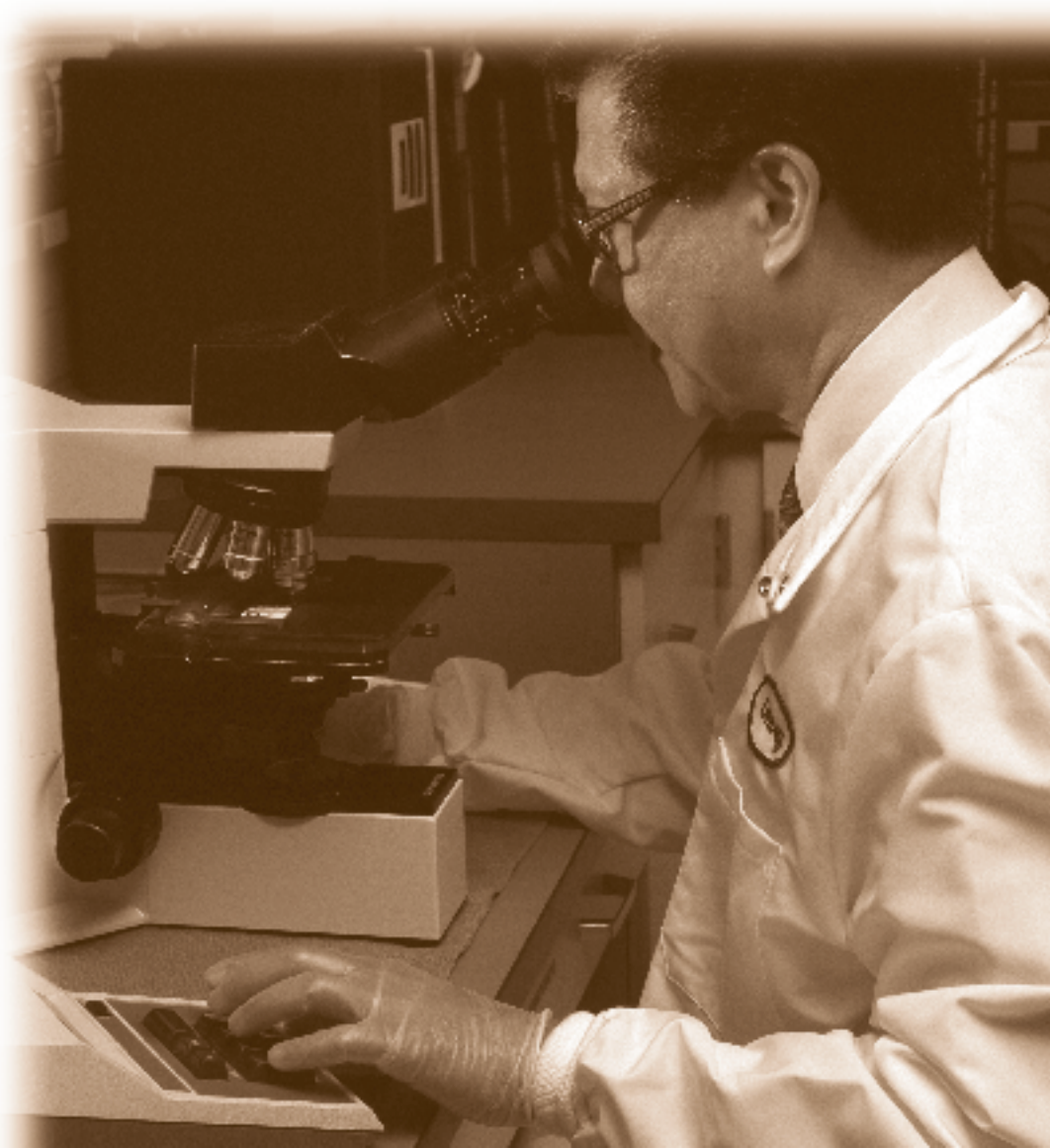
Analytical chemists work in laboratories, researching either alone or in groups.